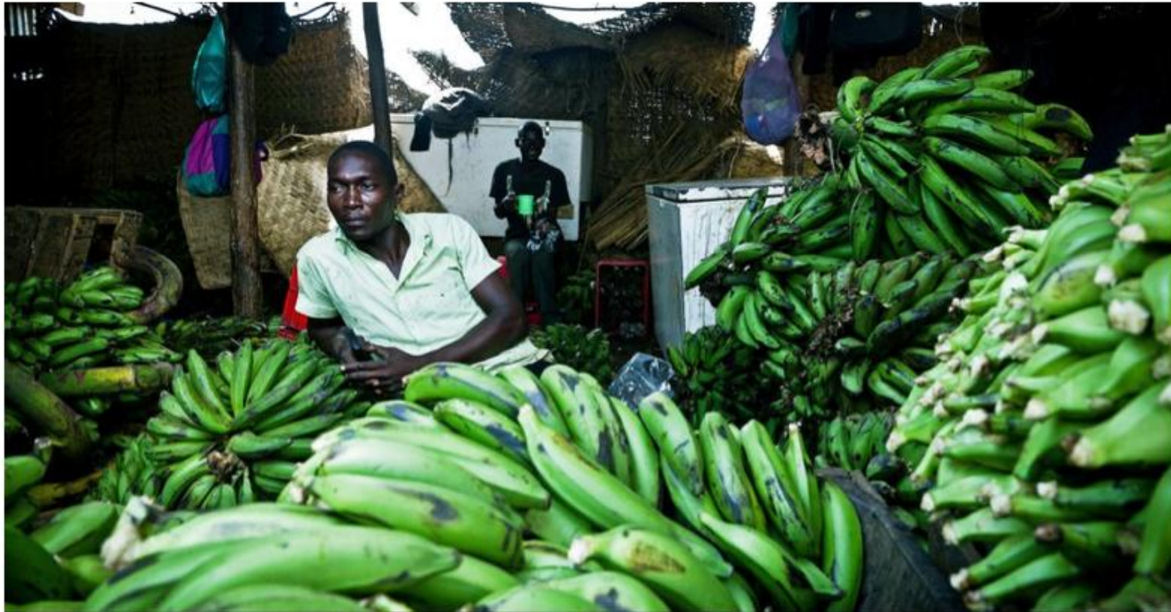
On the same day, a South Sudanese market trader was pictured in Konyo Konyo market in Juba selling bananas imported from neighbouring Uganda.