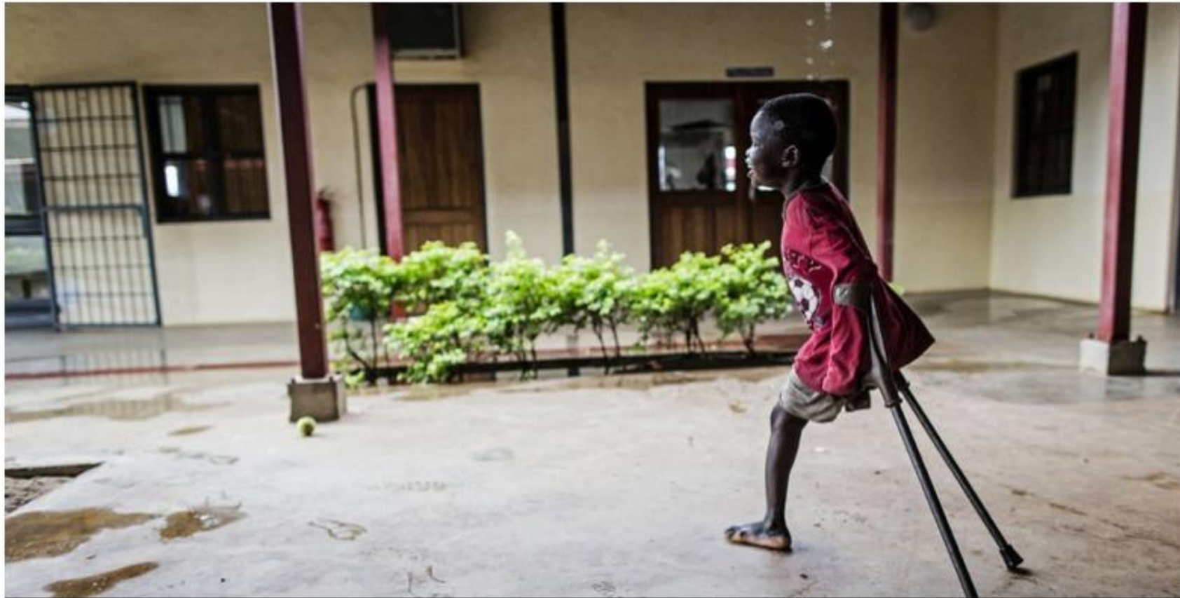
A seven-year-old South Sudanese amputee plays with a tennis ball at the Rehabilitation Centre of Juba on Wednesday. He lost his leg aged four after a mine he was playing with blew up, killing his mother.