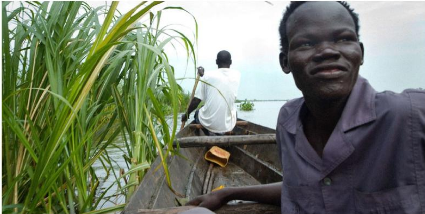
On Tuesday, the day before Sudan and South Sudan signed a deal on trade, oil and security, easing tensions that brought the two countries to the brink of war this year, South Sudanese fishermen near the border in Malakal work in a handmade boat on the River Nile.